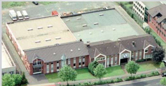
REMIS Cologne, development and administration