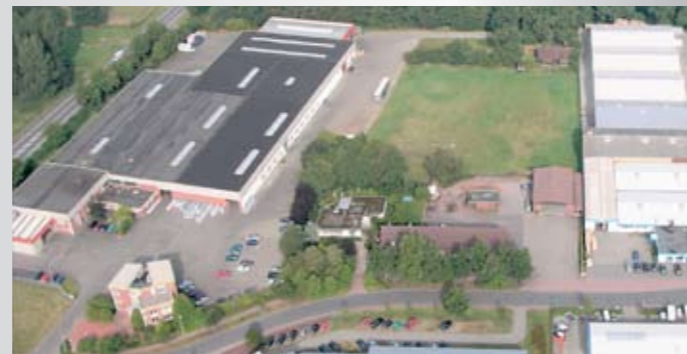
REMIS Gronau-Epe, production